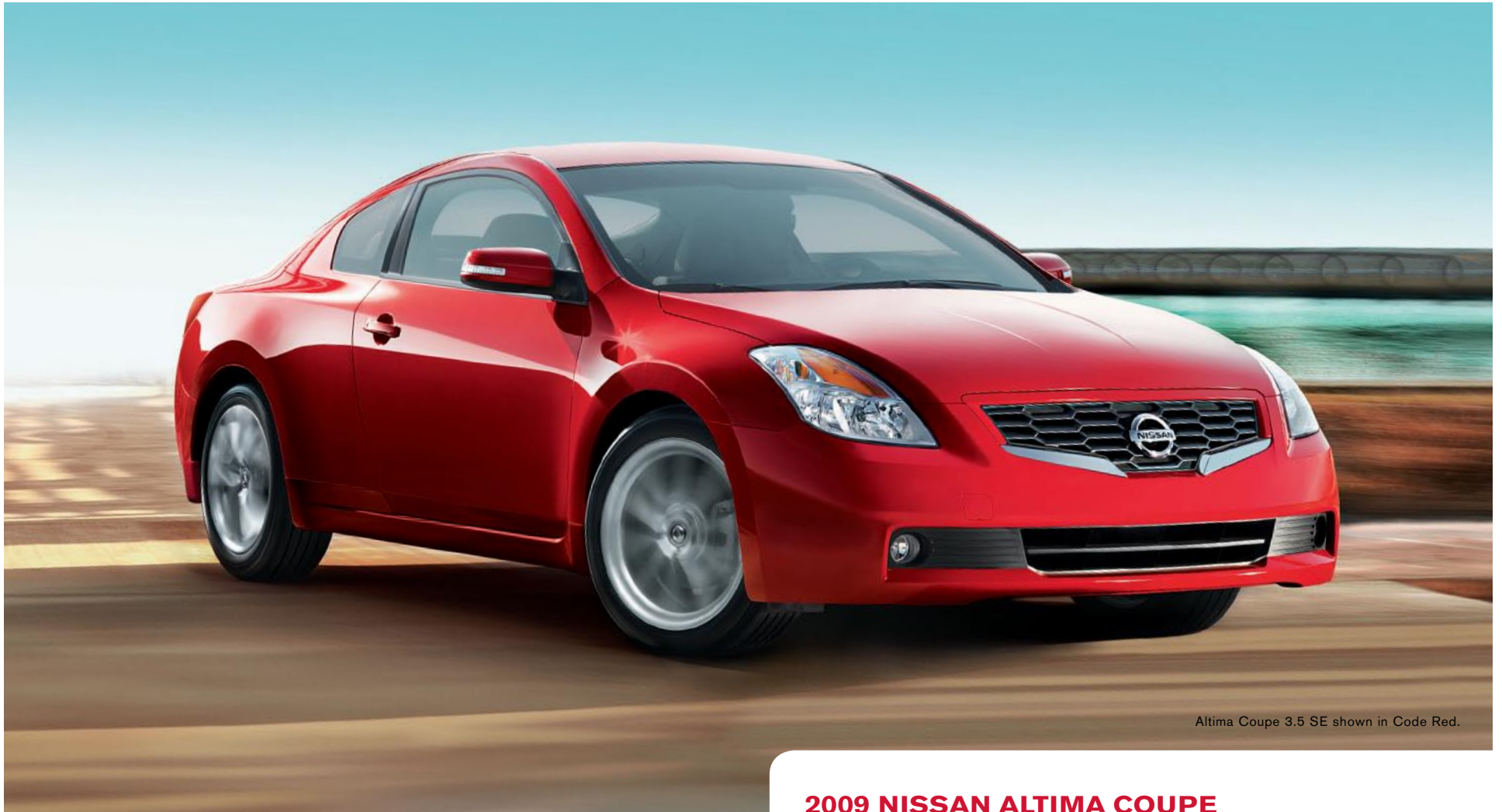
Altima Coupe 3.5 SE shown in Code Red.