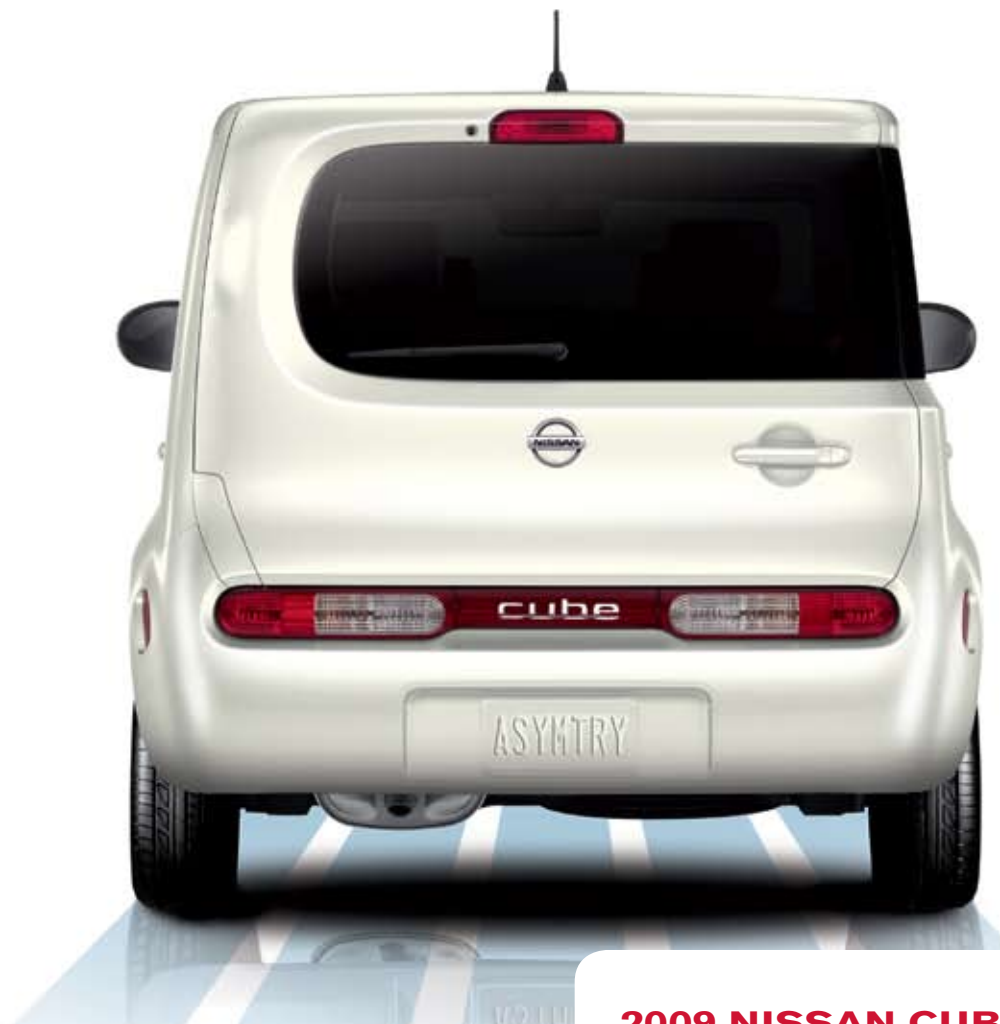
cube® 1.8 SL in Pearl White.