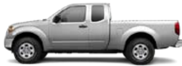
SE V6: KING CAB AND CREW CAB