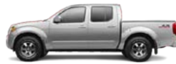
PRO-4X: KING CAB AND CREW CAB