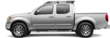
LE: KING CAB AND CREW CAB