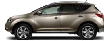
SL: WITH 360° VALUE PACKAGE