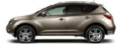
LE: PORTRAIT OF LUXURY