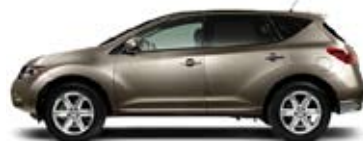
SL: STATEMENT OF BEAUTY