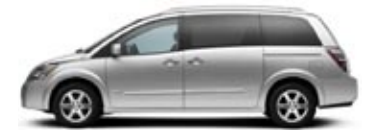
3.5 SE: RALLIES AROUND YOU