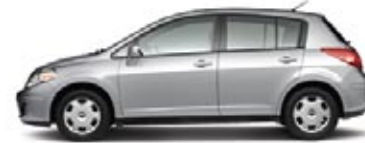
1.8 S: HATCHBACK AND SEDAN