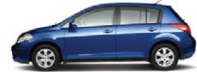
1.8 SL: HATCHBACK AND SEDAN