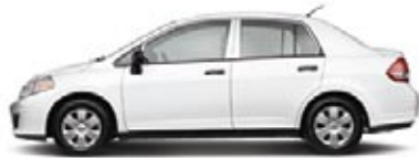
1.6 BASE: SEDAN ONLY