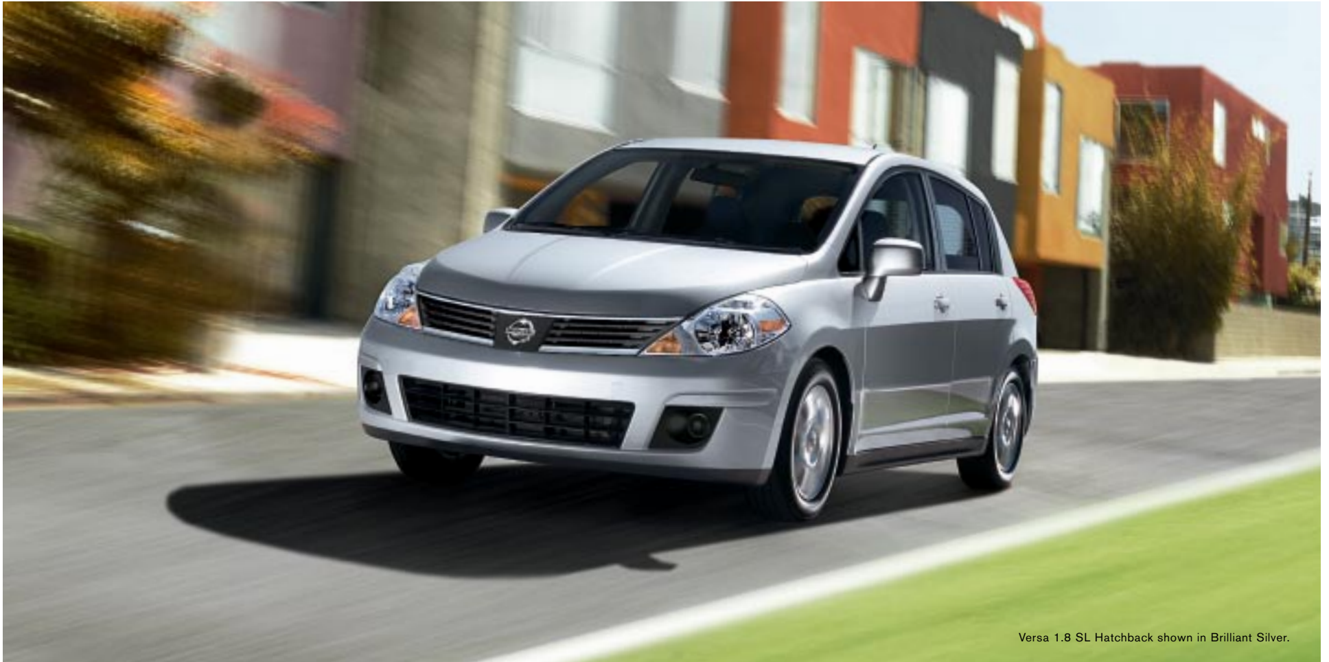
Versa 1.8 SL Hatchback shown in Brilliant Silver.