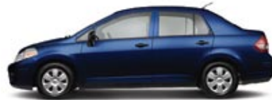
1.6: SEDAN ONLY